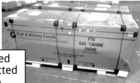
Damaged Unprotected Cargo

Unprotected cargo is often damaged during transport. ADLS cargo protection minimizes damage of expensive machinery and equipment.