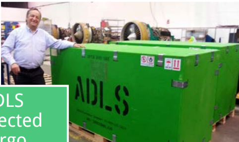
ADLS Protected Cargo

When damage does take place, ADLS's use of the Clear Spider inventory tracking system pinpoints where the damage occurred and documents the extent of the damage for review and insurance claims processes.