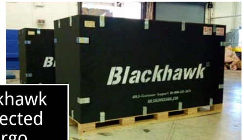
Blackhawk Protected Cargo